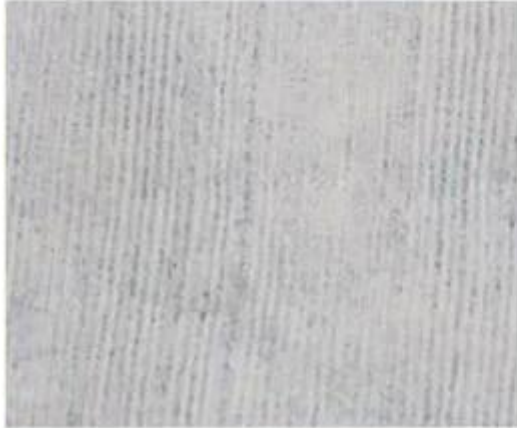
55% wood pulp & 45% polyester