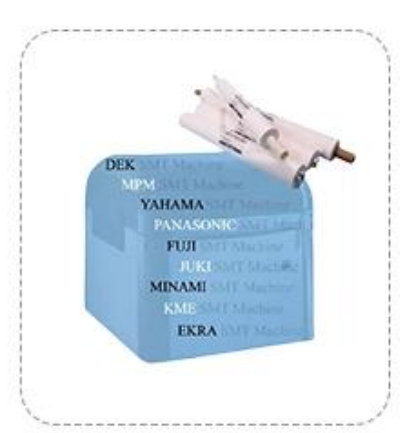
SMT Stencil Clean Roll