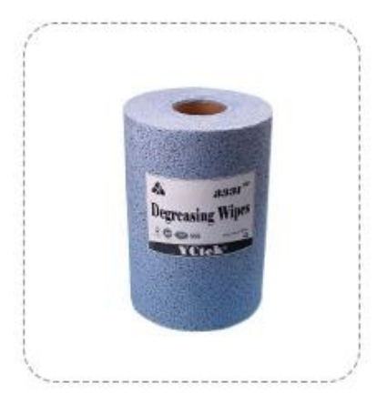
Meltblown Nonwoven Fabric