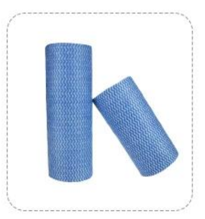
Household cleaning wipes