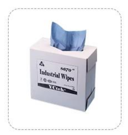
Blanket Wash Cloths