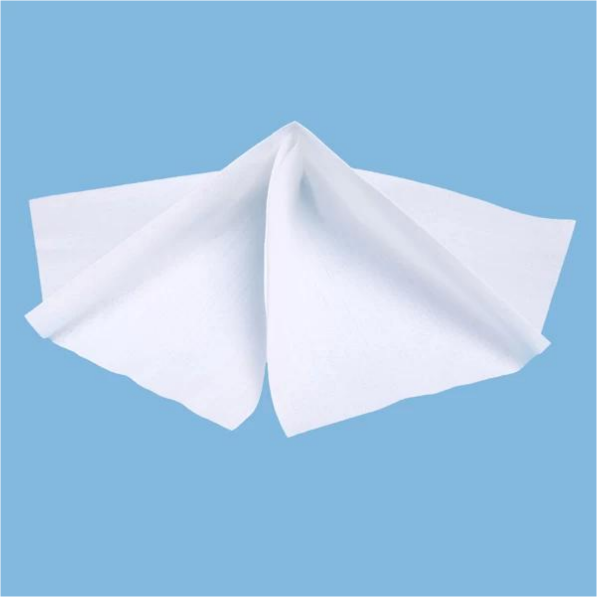
55% Cellulose 45% Polyester SMT Cleaning Wipe Stencil Roll For Print Machine