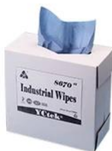
Blanket Wash Cloths