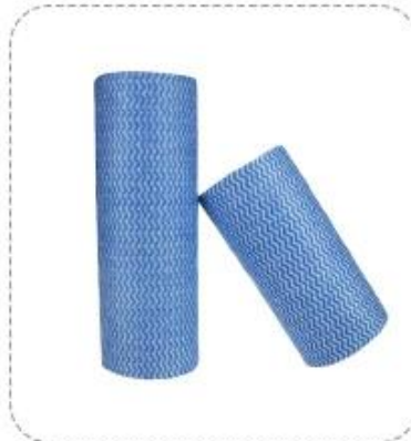
Household cleaning wipes