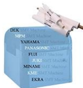
SMT Stencil Clean Roll