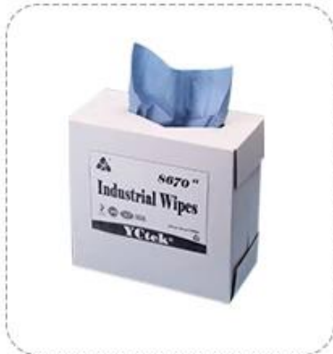
Blanket Wash Cloths