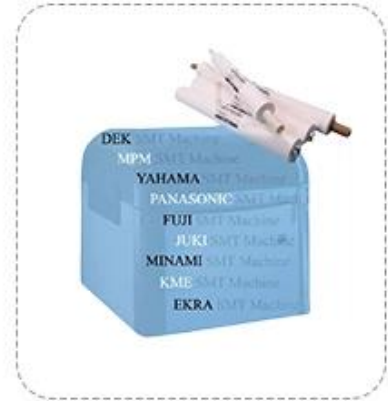
SMT Stencil Clean Roll