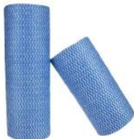
Household cleaning wipes