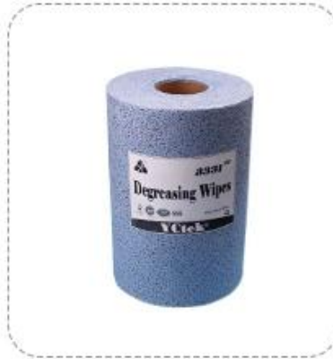
Meltblown Nonwoven Fabric