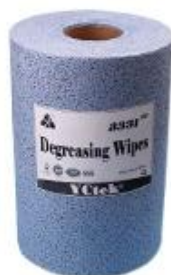
Meltblown Nonwoven Fabric