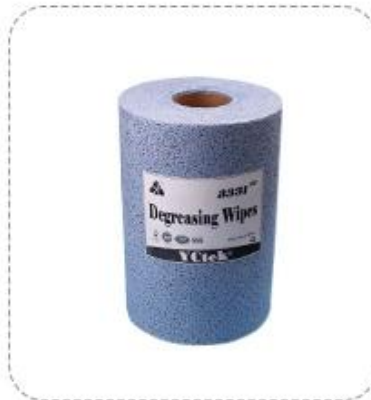
Meltblown Nonwoven Fabric