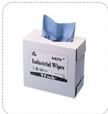
Blanket Wash Cloths