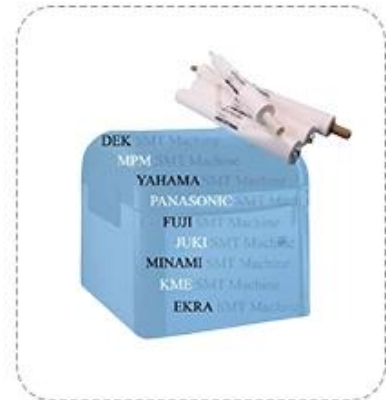
SMT Stencil Clean Roll